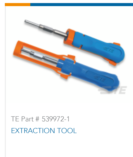
TE Part # 539972-1 EXTRACTION TOOL