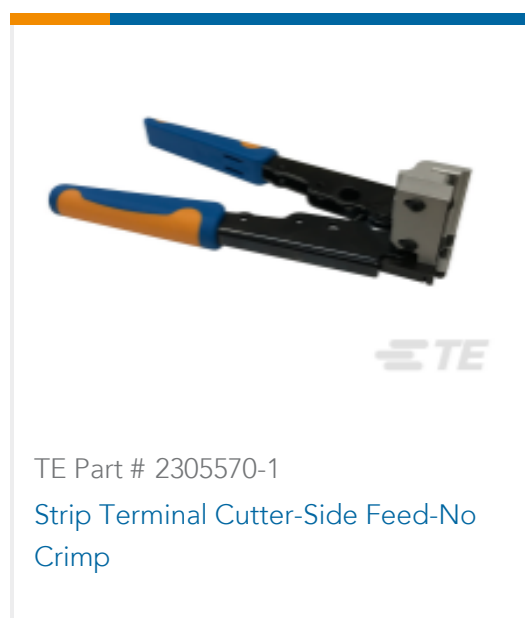
TE Part # 2305570-1 Strip Terminal Cutter-Side Feed-No Crimp