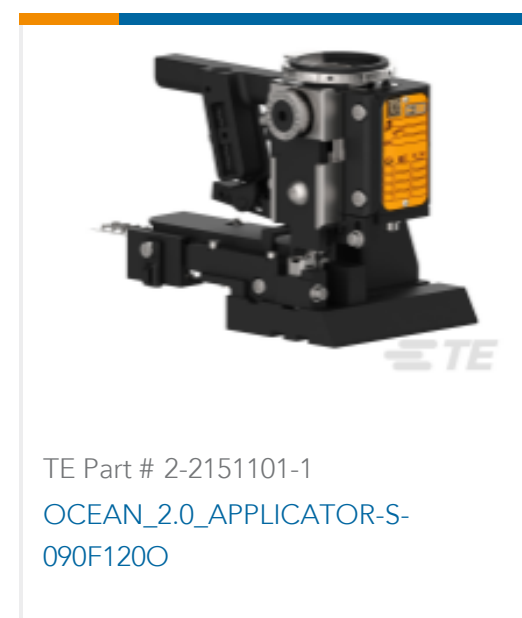
TE Part # 2-2151101-1 OCEAN_2.0_APPLICATOR-S-090F1200