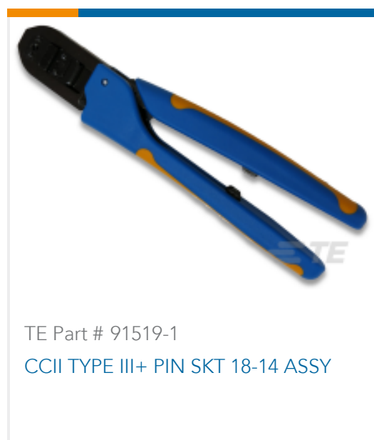
TE Part # 91519-1 CCII TYPE III+ PIN SKT 18-14 ASSY