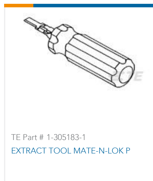
TE Part # 1-305183-1 EXTRACT TOOL MATE-N-LOK P