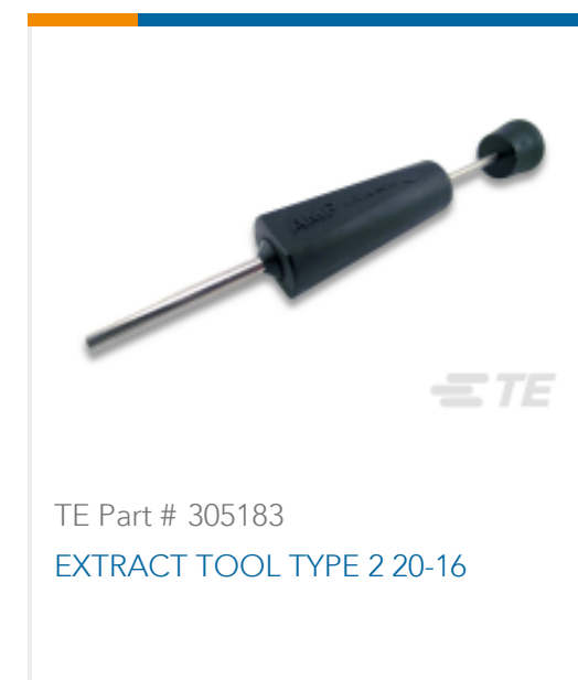
TE Part # 305183 EXTRACT TOOL TYPE 2 20-16