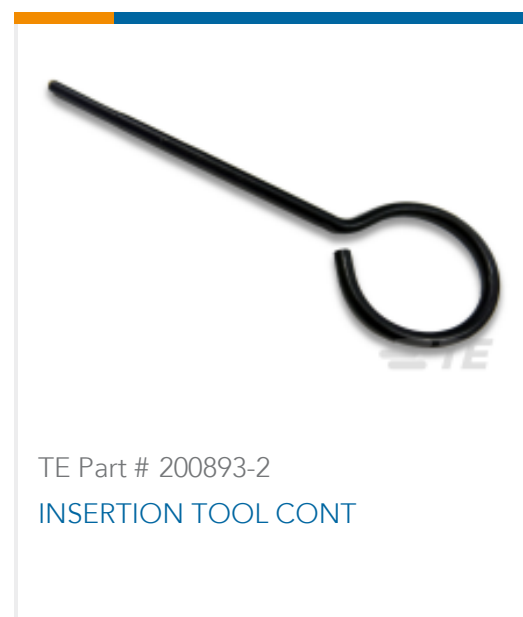
TE Part # 200893-2 INSERTION TOOL CONT