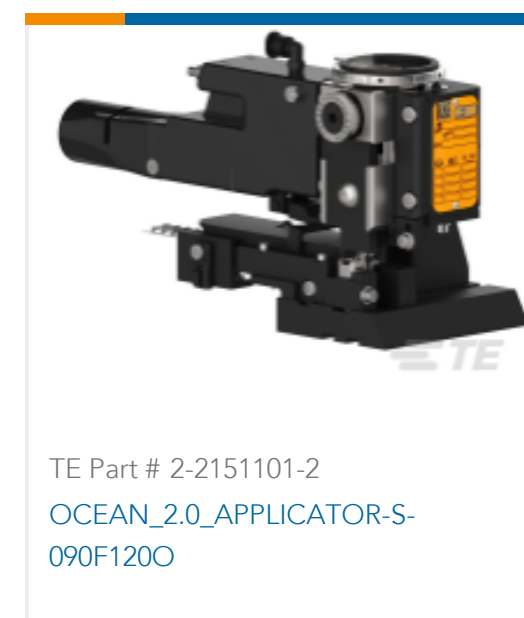
TE Part # 2-2151101-2 OCEAN_2.0_APPLICATOR-S-090F1200